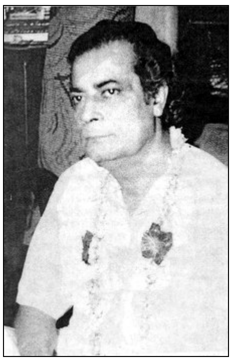
Dadaji (1906 – 1990)

Indeed the three major theories that affected a titanic breakthrough in modern science and ushered in a brave new world of the space age may all be fathered upon the fell gullibility of Einstein breathing the stinky morass of God-phantasmagoria (shifting series of phantasms, illusions, or deceptive appearances). He was the sole architect of the general theory of Relativity, while being largely responsible for the special theory of