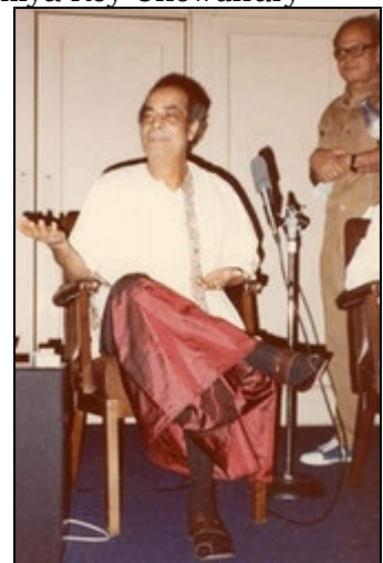
Portland, Oregon USA