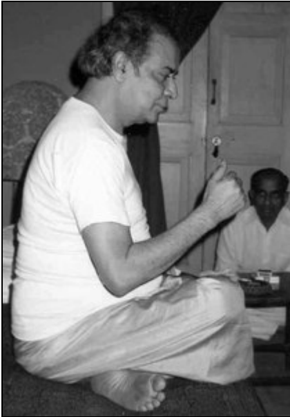
Dada – Bombay 1982

Truth expressed is Truth expired. But Truth, by its very nature is expression for itself, by itself and of itself...the anonymous, stirless Void...of the Absolute Existence lying in state upon Existence.