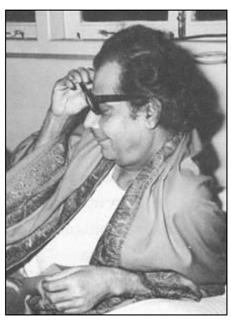
Dadaji . 1973 Bombay

Although from his boyhood Dadaji was given to curing all kinds of diseases with a simple touch of his magnetic hand or bringing back impaired vision with a rub