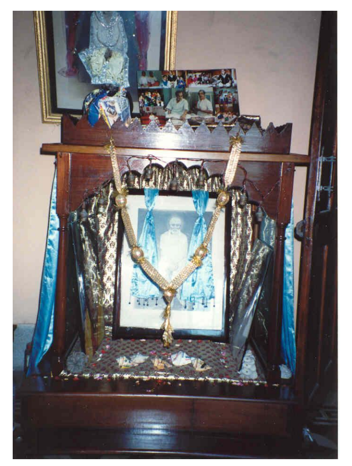
Visitors placed bottles of plain water at this Satyanarayan alter in Dadajios home where the pure water transformed into fragrant, milky Charanial

carried good tidings for all. The test result was stark negative. How could it be otherwise with a man who is constantly shepherded by one who is nobody?