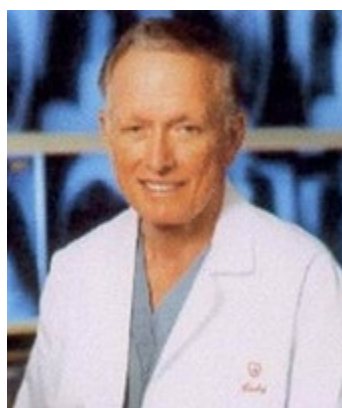
Dr Denton Cooley