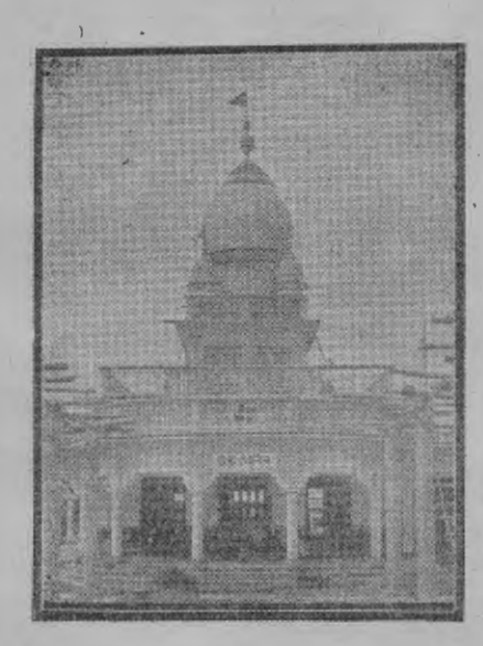
SAMADHI-MANDIR: CHAUMOHANI: NOAKHALI